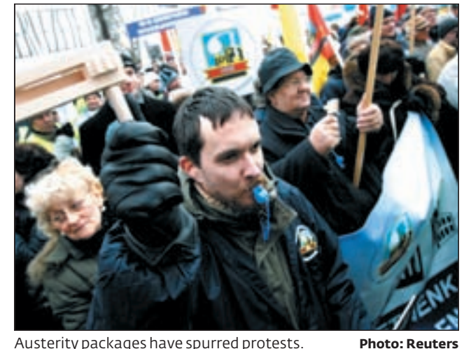
Austerity packages have spurred protests.

From the perspective of growth and convergence based on both internal factors (investments, consumption) and external factors (capital flows, trade) it is evident that the new member states which have coped better with the crisis are those which had produced high but not overheated growth since accession, coupled with an appropriate level of external and internal financial stability, a low budget deficit and a healthy public debt indicator. In the case of Poland, an addiin other countries in the wider central European region than in Poland, in which the financial deepening was slower. In other states where credit was the most important factor in increasing demand, the sudden crash in the financial markets resulted in a demand shock, or in other words that overconsumption had to be adjusted to the available income. This shock was much bigger in other countries than in Poland.