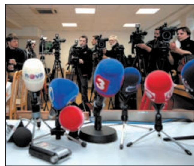
The media is freer, but also feels less secure.

Przybylski Wojciech (WP): 20 years ago there was an outburst of new, independent press both on a local and national level. Gazeta Wyborcza has been an example of one of the most successful media ventures in the press sector. Radio and TV were in a much tougher environment since broadcasting has been allowed only under concessions. Thus, only a few