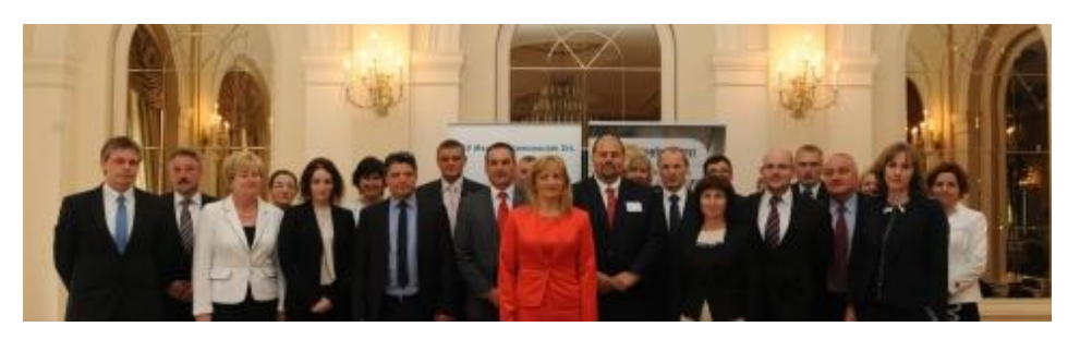
Executives of V4 railway companies

Under the Hungarian Presidency, high level representatives of the V4 ministries responsible for transport held several fruitful coordination meetings before the meetings of relevant EU bodies (Transport, Telecommunications and Energy Council) and reached common positions on issues such as the Fourth Railway Package or Single European Sky regulations. Furthermore, representatives of the V4 Aviation Authorities, as well as V4 experts on Combined Transport had meetings in Budapest. Heads of the four national railway companies also convened, agreeing on closer cooperation to improve the competitiveness and efficiency of the region's railway networks.