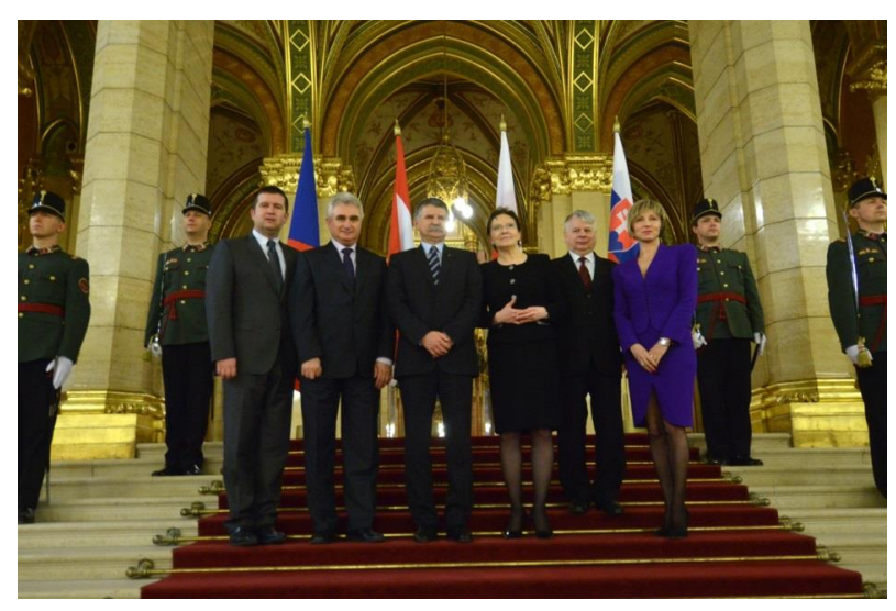
Meeting of the Speakers

Presidents of the four Parliaments' Foreign Affairs Committees at their meeting in Visegrád 30-31 January 2014 tabled an official proposal, which was finalised at the Meeting of V4 Speakers on 28 February 2014 in Budapest. According to the Speakers' agreement, prior to the annual meeting of the V4 Speakers of Parliaments, the Parliament of the incumbent V4 Presidency may call for a V4 Plenary Meeting, where the Speakers would be accompanied by a maximum of ten representatives of appropriate Parliamentary Committees covering the agenda items of the Speakers' Meeting.