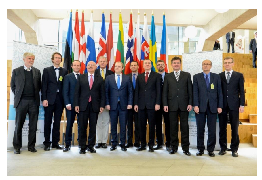
Foreign Ministers of V4, Nordic and Baltic Countries

Turning to the North, the Visegrad Cooperation is joining hands with the Nordic-Baltic-8 countries: Denmark, Estonia, Finland, Island, Latvia, Lithuania, Norway and Sweden. Hungary co-chaired the second V4+NB8 foreign ministerial meeting organised in Narva, Estonia on 6-7 March 2014. The Hungarian Presidency aimed for useful Visegrad–Nordic-Baltic cooperation also on the expert level: Budapest hosted the first meeting of Security Policy Director Generals on 21 January 2014, and the Hungarian Embassy in Stockholm organised an experts' seminar on fostering cooperation among regions of the EU's Baltic-Sea and Danube Region Macroregional Strategies on 2 April 2014.