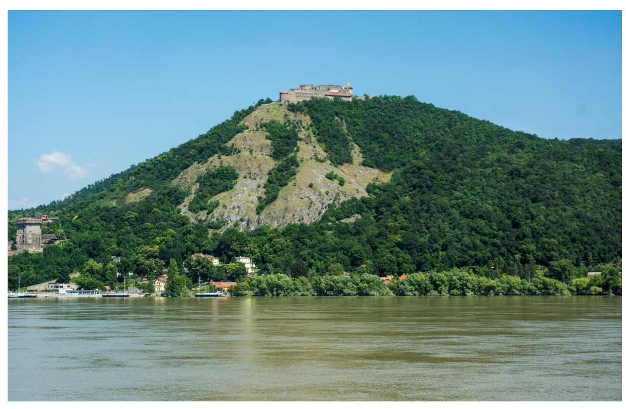
The Castle of Visegrád, Hungary