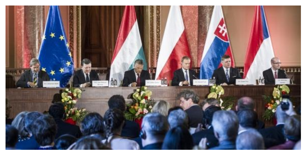
Meeting of V4 Prime Ministers and President of the European Commission in Budapest

their common positions concerning the unfolding events in Ukraine. They met again during the GLOBSEC Conference on 15 May 2014. The Prime Ministers also consulted regularly on the margins of European Council meetings, achieving unity of efforts on important foreign and security policy issues. The Hungarian Presidency was closed and summed up by the V4 Heads of Government at their Budapest meeting on 24 June 2014, with the President of the European Commission Jose Manuel Barroso and EU Commissioner Johannes Hahn also present. They discussed, among other topics, the absorption of European funds for regional development in Central Europe, and the perspectives of European integration.