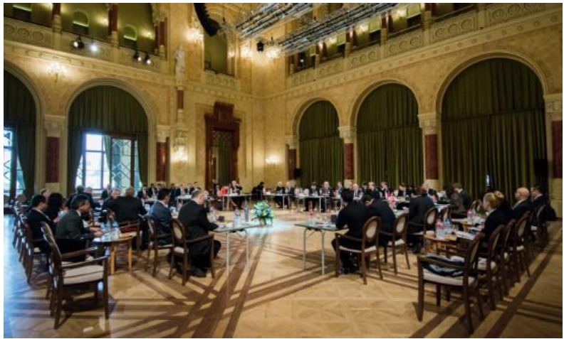
V4 – Eastern Partnership Ministerial Meeting

The Visegrad Group – Eastern Partnership informal foreign ministerial meeting was convened for the fifth time on 28-29 April 2014 in Budapest. The Ministers of Foreign Affairs of the Visegrad and Eastern Partnership countries, as well as the representatives of the EU Presidency, the Commission, the European External Action Service and the Nordic-Baltic countries discussed the future of the Eastern Partnership in light of the new challenges and mid-term tasks to be dealt with halfway between the Vilnius and Riga Summits. All speakers confirmed the validity of the Eastern Partnership policy, and stressed the commitment to implement the goals set in the Vilnius Declaration. They noted a substantial change in the geopolitical context of the realisation of these goals, and agreed in the need to adapt to the changed environment and to react jointly and effectively to the new challenges ahead. V4 Ministers stressed that a perspective of European integration, close political association and economic integration remain the best stimuli for deep reforms. The Ministers encouraged partner countries to make full use of the "more for more" principle, and expressed support to additional EU funding in support of reform efforts.