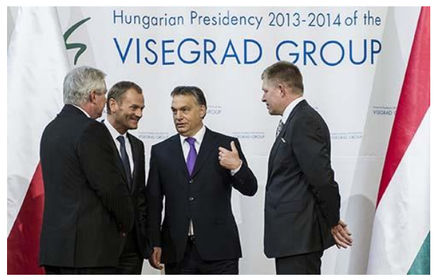
Visegrad Prime Ministers' Summit

At the Visegrad Prime Ministers' Summit of 14 October 2013, the heads of government agreed that European production of shale gas was desirable. V4 countries also support nuclear energy use and expect the EU to consider nuclear energy as one of the supported low carbon technologies, helping Central Europe increase its nuclear energy capacity. The V4 Prime Ministers agreed that every country had the right to define its own energy-mix, produce energy from the most convenient sources available; and there should be no discrimination in the EU regarding nuclear energy.