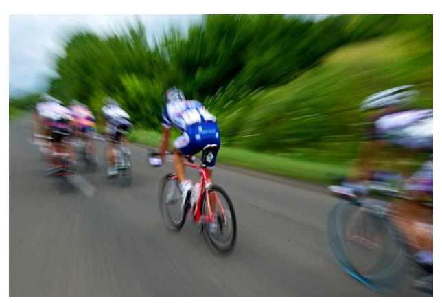
Visegrad 4 Bicycle Race

Sports also promote international understanding. The Hungarian Presidency continued with the initiative of the Polish Presidency, and organised the Visegrad Bicycle Race 13-18 May 2014, the home stretch being, naturally, by the hills of Visegrad. The four national bicycle associations were active in the organisation of this official race, open to both professional and amateur cyclists, supported by the International Visegrad Fund.